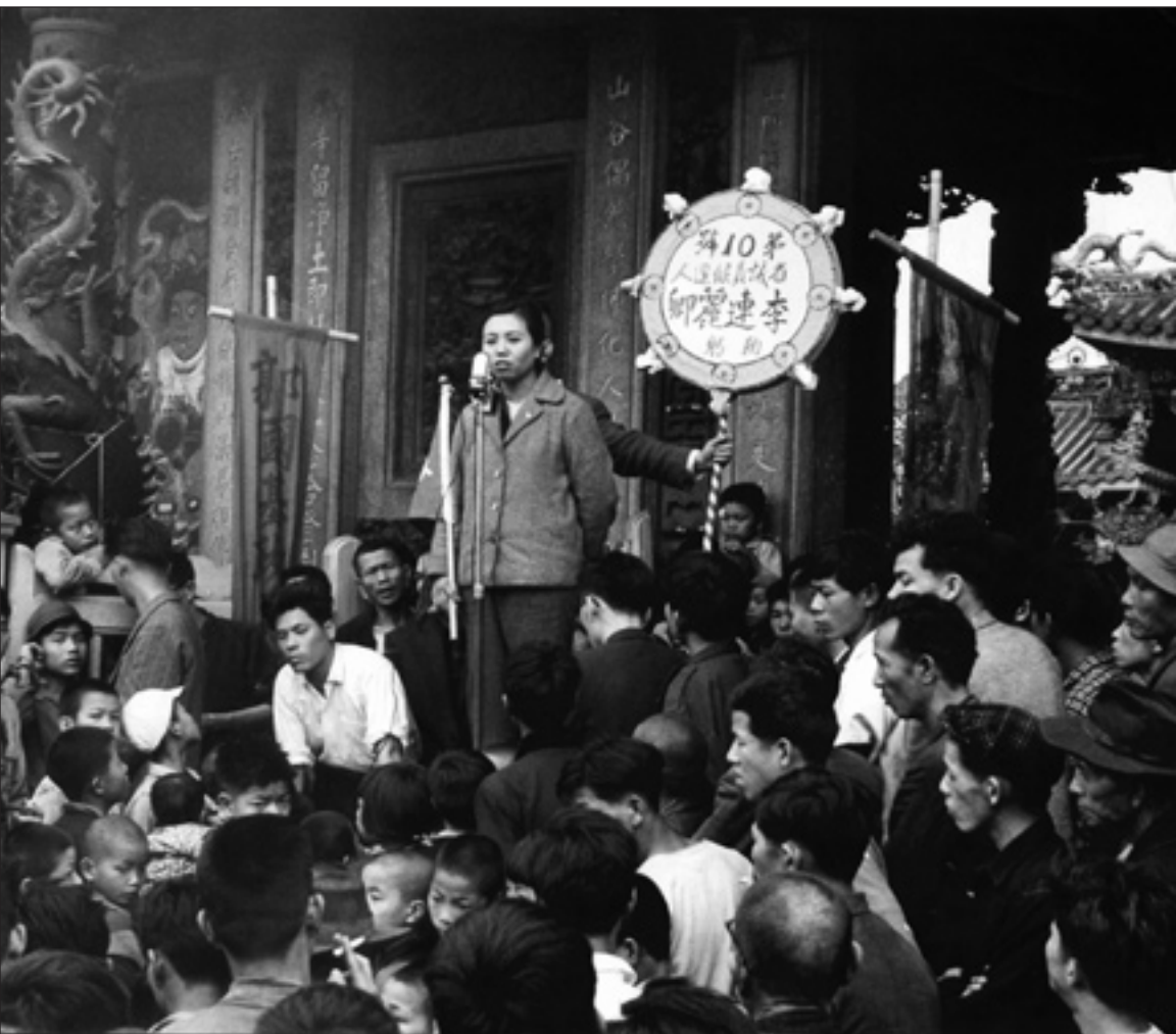
During 1950–51 the KMT promoted local elections in the counties and township cities of Taiwan. (1950)