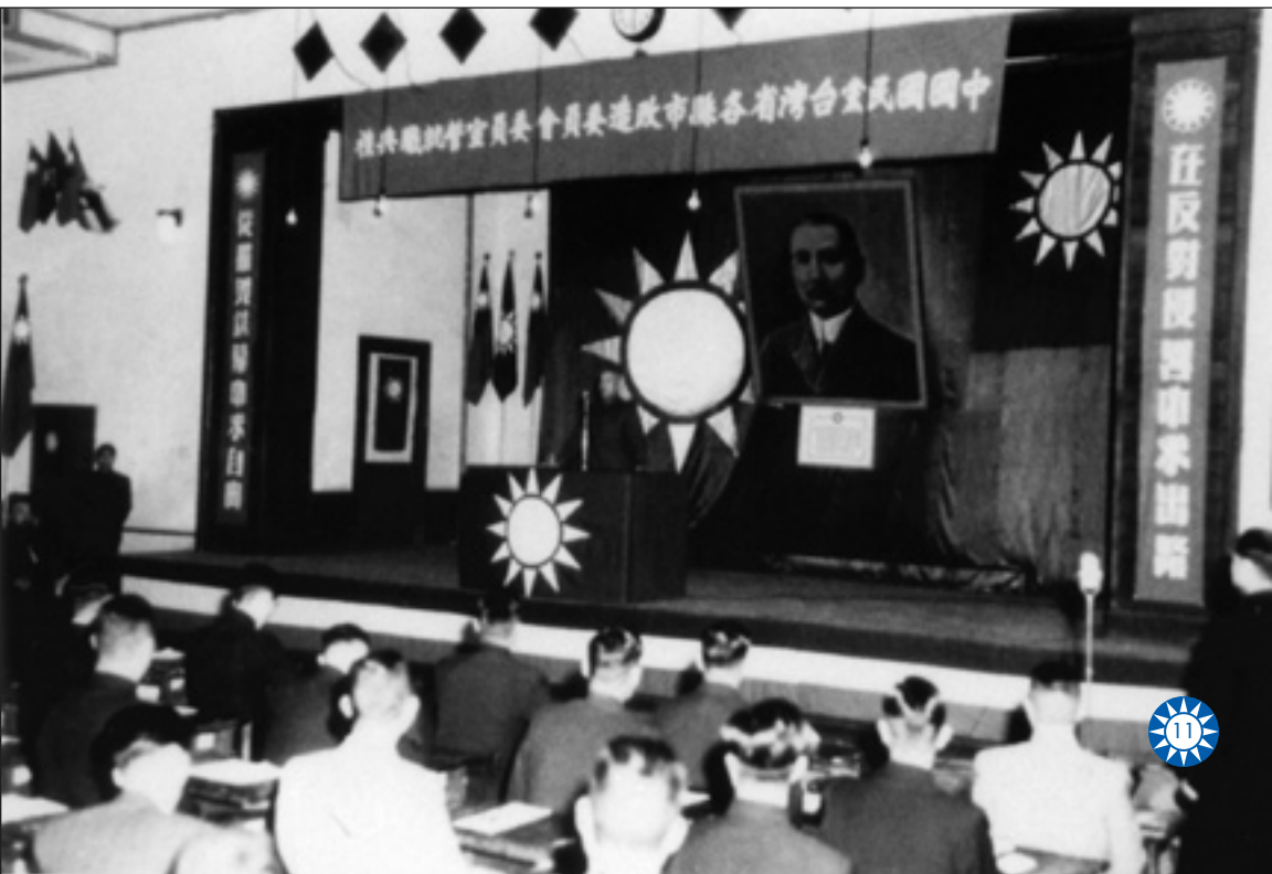
As the reforms began, branch offices of the Central Reform Committee sprang up in the cities and counties of Taiwan. (1950)

the mainland, the KMT had made the party branch ( qu fenbu ) the basic organizing unit and the work team ( xiaozu ) to train party members in how to read reports and discuss current events. When reform began in Taiwan, the CRC made its work teams responsible for enforcing party policies and informing members how to behave. They were also to produce propaganda, prevent communist infiltration, and recruit new party members after investigating their backgrounds, as well as to hold regular meetings to discuss party strategy. 33 The new party, then, behaved very differently from the way it had before 1949, with its work teams having new managerial and training responsibilities.