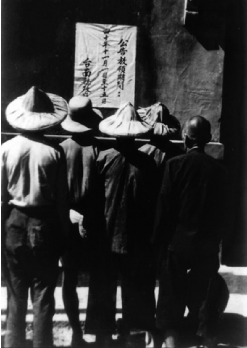
Farmers and landlords examine an announcement of the Redistribution of Public Lands Act. This law allowed the ROC government to redistribute public lands to Taiwan's poor farmers and tenants. (1951)