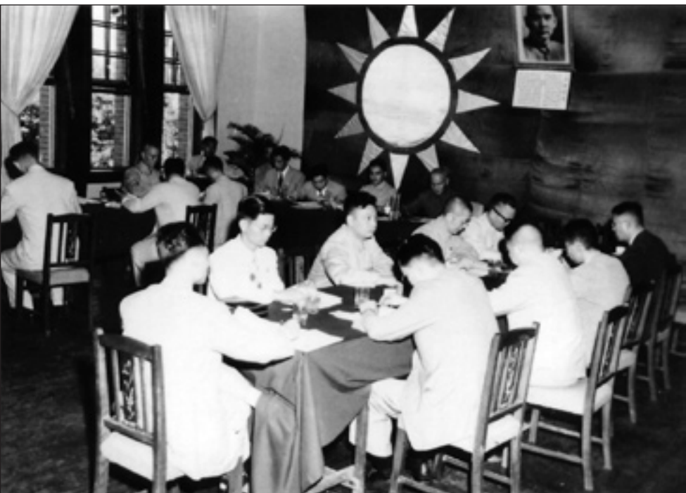
In August 1950, the KMT held its first Central Reform Committee meeting to launch the party's reforms. (1950)